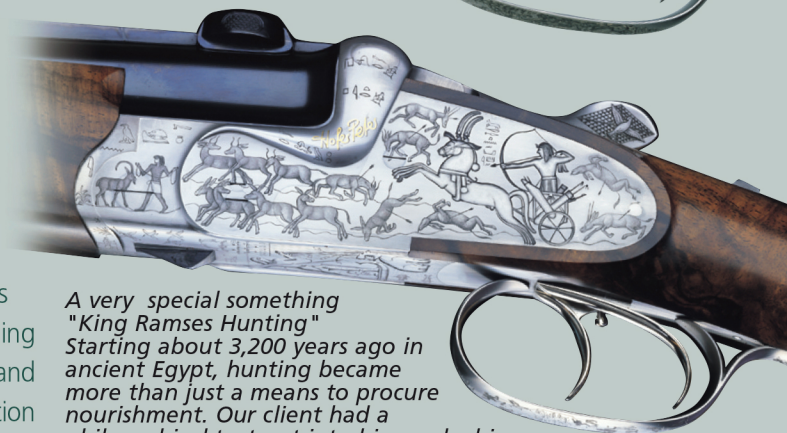
A very special something "King Ramses Hunting" Starting about 3,200 years ago in ancient Egypt, hunting became more than just a means to procure nourishment. Our client had a philosophical text put into hieroglyphics to be engraved on this rifle.