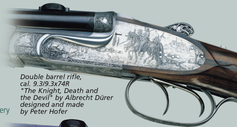
Double barrel rifle, cal. 9.3/9.3x74R "The Knight, Death and the Devil" by Albrecht Dürer designed and made by Peter Hofer

Exquisite hunting guns and rifles, in more than 300 calibre combinations, from .22 Hornet up to .700 Nitro Express; double rifles, shotguns, single shot "Kipplauf" rifles, drillings, four and five barrelled guns, bolt action rifles - in side-lock or box lock versions.