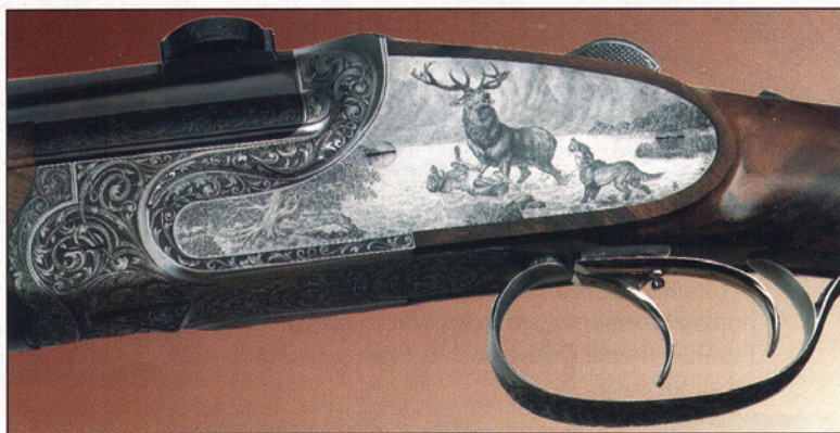
◀ Work of art: Hofer guns are engraved by some of the world's best craftsmen

Hofer shotguns are made in 12, 16 and 20-bore, while stock shape and dimensions are to the customer's wishes. Rifles are a