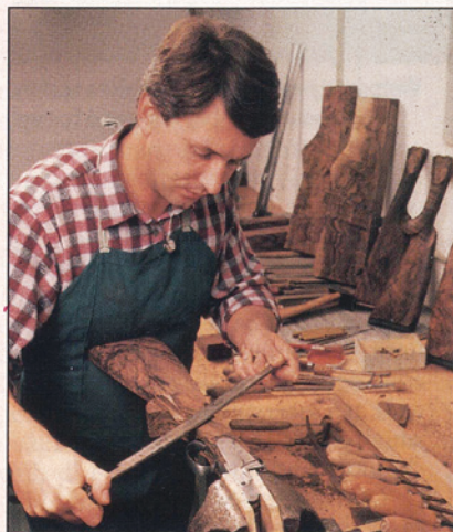
◀ Wooden splendour: the finest materials are used for the stocks